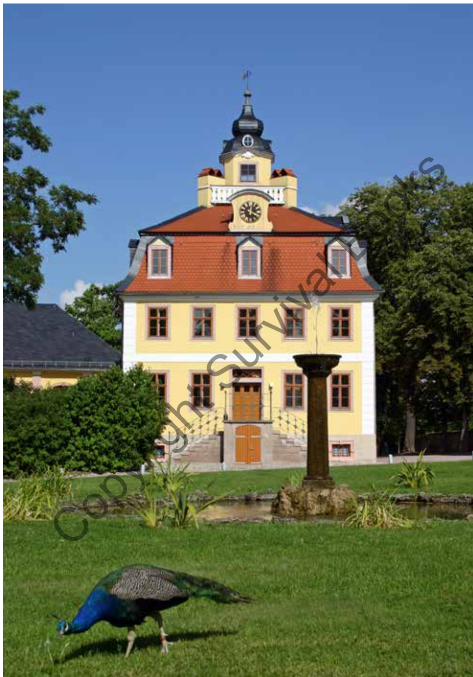
Schloss Belvedere, Weimar